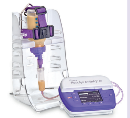
Highest shelf position Pack & Bottle giving set with dripchamber