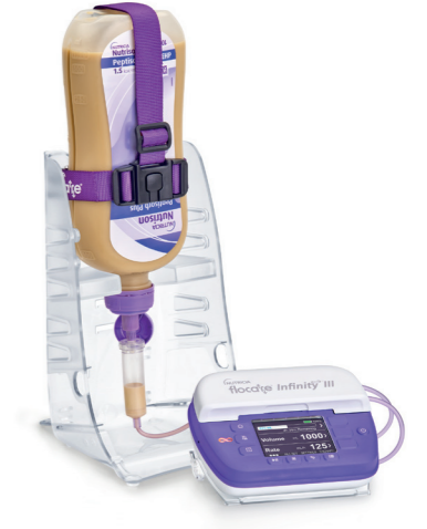
Highest shelf position Pack giving set with dripchamber