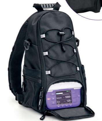
Backpack with direct access to the pump via the front zipper